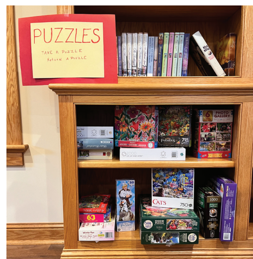
We have a new puzzle lending shelf in the Library!