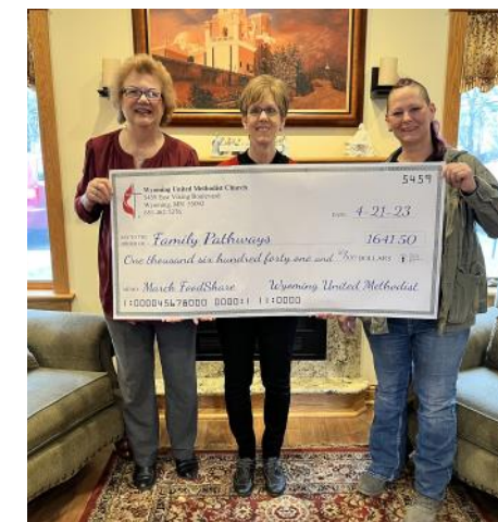
WUMC raised $1641.50 for March FoodShare