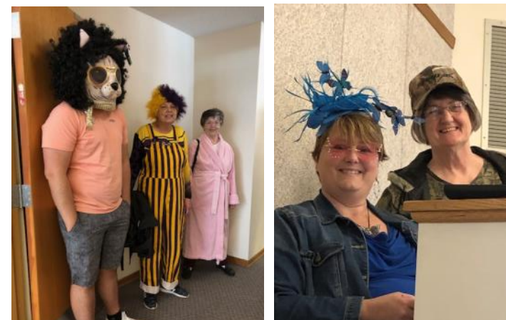
More pictures from Holy Humor Sunday coming soon to our website.