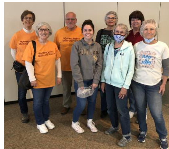
These Wyoming UMC volunteers packed 2160 meals!