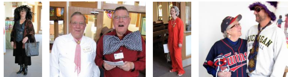
This is just a few of last year's humorous ensembles...