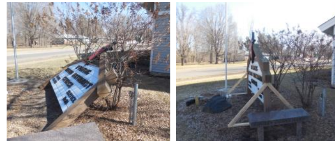
Our sign is risen! It is risen indeed!